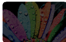
General illumination Color Effects