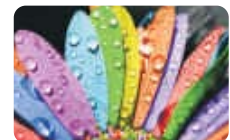
Ir-cut Zoom Camera Daylight Effect No color cast, No Sub-exposure