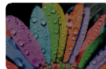
Low illumination Color Effects