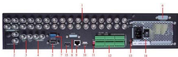
Rear Panel of DS-9016HFI-RH