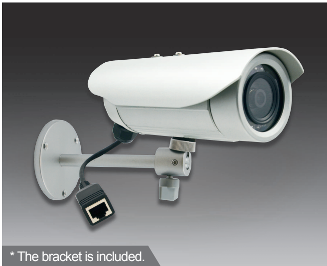
* The bracket is included.